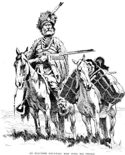
AN OLD-TIME MOUNTAIN MAN WITH HIS POSSES.